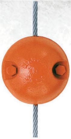
Split Overhaul Ball