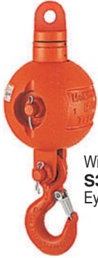
With S320 Eye Hook