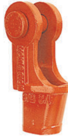
Both styles available with optional McKissick® Wedge Socket Assembly or S-421 TERMINATOR Wedge Socket