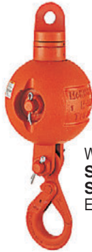
With S1316 A SHUR-LOC® Eye Hook